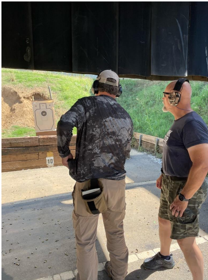
Chuck coaching Buck.

I'll be blunt. If you aren't legally justified to be shooting it, you aren't legally justified to be pointing a firearm at it.