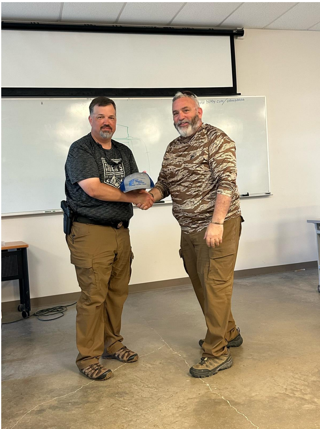
The instructor presenting the author with a hat for having the best score on a school drill. Also, see our new line of pants and shoes at your finer clothing retailers.

If you are looking for a class from which you will come away with tools for teaching the PMO, this course will satisfy that need.