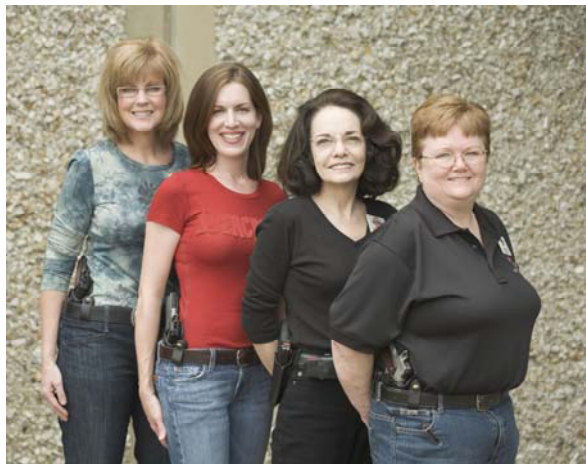
The Ladies Only Class is taught by a group of very talented female instructors.

Approximately every other month, Rangemaster offers a 4-hour Ladies Only Introduction to Handguns course. Attendance is limited to female students and the entire course is taught by our group of female certified instructors. This is a good place to start for ladies who want to know how to safely handle a handgun, and may be hesitant to jump right into a basic class. The next class is Sunday, June 14, from 2:00pm to 6:00pm. Cost is only $49.00, which includes gun, ammunition, and everything needed for the class. Call 901-370-5600 to register.