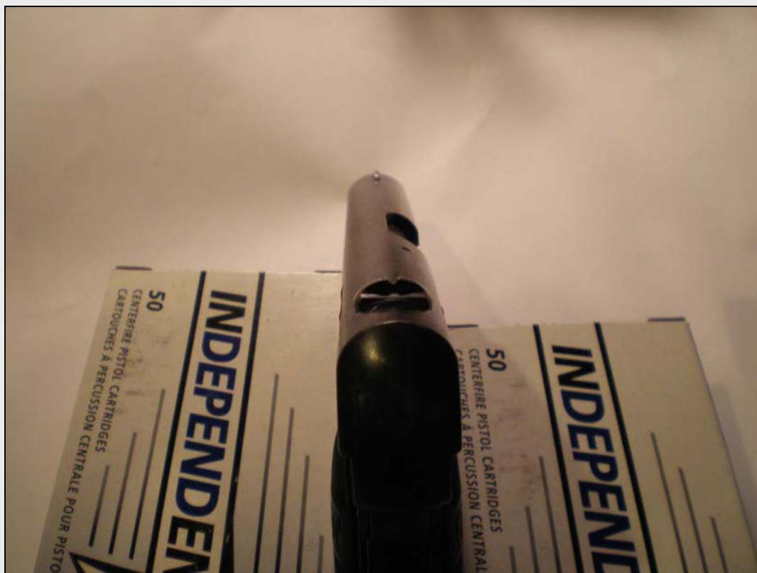
Colt 1908 Model, showing the pathetic little sights on guns of the era.

This begs the question, "Why did Fairbairn persist with such an ineffective technique?" I believe the answer is quite simple, and can be readily illustrated. The SMP issued all sidearms used by its officers, and because they had both European (mostly British) officers and smaller stat-