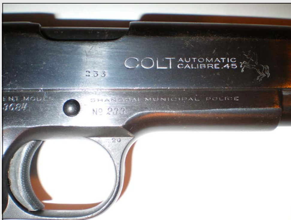
Shanghai Municipal Police markings on Colt 1911 pistol made in 1927