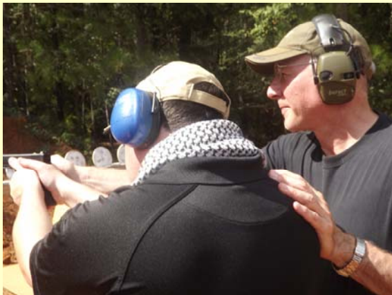
Coaching is an important skill for trainers, and is emphasized in our Instructor Development Courses.