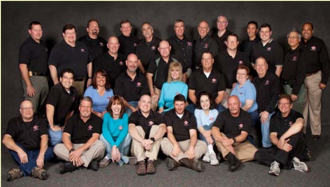
Rangemaster's 2012 Instructor Cadre. Ten of the trainers in this photo have worked at Rangemaster for over ten years.