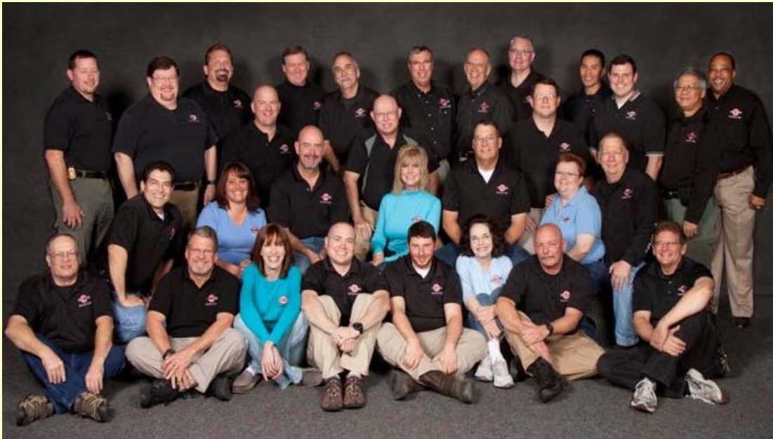
Rangemaster's 2012 Instructor Cadre. Ten of the trainers in this photo have worked at Rangemaster for over ten years.

Memphis, TN 2-4 August 2013 (indoors, air conditioned)