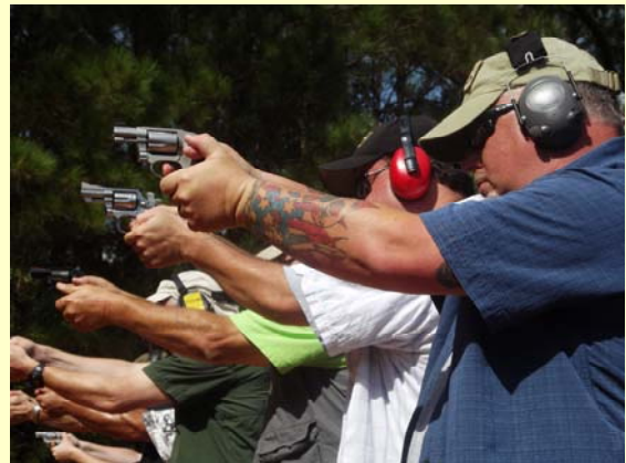
Students firing snubby revolvers during an Instructor Development Course. Candidates have to know how to shoot handguns other than the one they carry themselves.