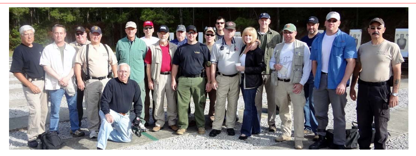
Class pic from Combative Pistol in Florence, South Carolina in 2011. We'll be back there in March, 2012