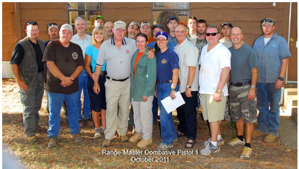
Range-Master Combative Pistol 1 October 2011