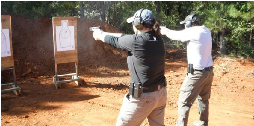
Two students performing well in Combative Pistol, Americus, Georgia.

It looks like we'll be on the road even more in 2012. We'll be back at just about all the locations listed above, plus we'll be doing a Four-Day Firearms Instructor Course in the Seattle area in June. I look forward to seeing our old friends and to making new ones in our travels.