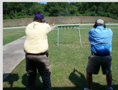
Father and son - who can clean the plates faster?