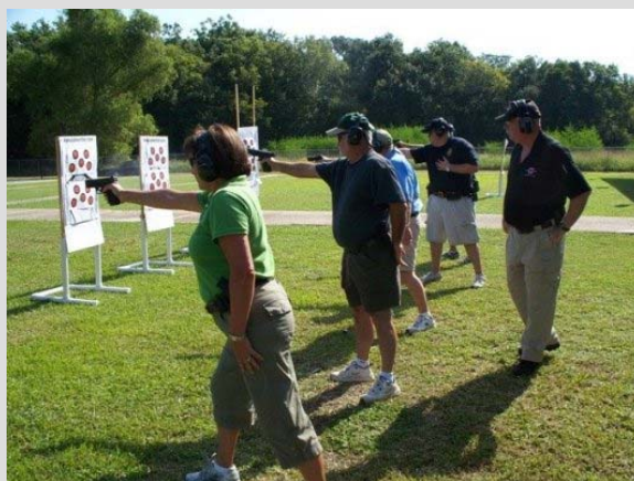
One hand, weak hand, over and over.

Your Grip – You learn how to grip your gun regarding lateral and linear forces, where to put your extra digits, etc. We are encouraged to get our fingers WAY off the trigger when not on target, specifically to rest them on the slide. 1911 shooters are cautioned to keep thumbs on the safety and pointers off the slide stop pin.