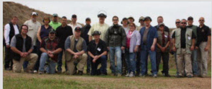
Author (far right) at Rangemaster Tactical Conference. Training groups at conferences tend to be diverse, bringing students of various backgrounds, skill levels and primary interests together. This allows for a lot of positive information exchange.