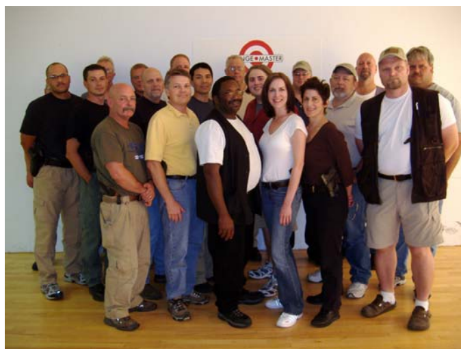
Graduates, 2008 Firearms Instructor Course

Students who successfully complete this course receive a certificate as a Rangemaster Certified Handgun Instructor. This qualifies for a State Certified Handgun Instructor license from the state of Tennessee. This class fills every year, so call 901-370-5600 soon to register. Cost is only $449, which INCLUDES 700 rounds of ammunition.